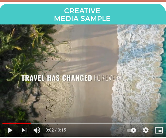
Travel Has Changed Forever