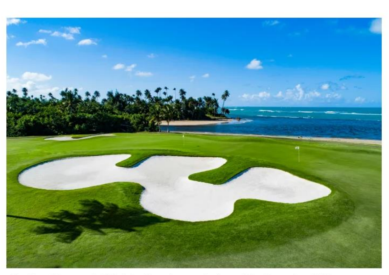
The Grand Reserve Golf Club has been host to the Puerto Rico Open since 2008. Grand Reserve Puerto Rico

Golf Pass / Golf Advisor (361,219 UVM) – "Golfers Choice 2022: Top 50 U.S. Courses – St. Regis Bahia Beach No. 6" (course and resort also recognized for top service)