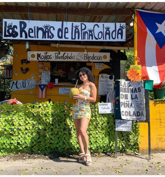
Liked by renatobrasil13 and 4,382 others discoverpuertorico One piña colada a day keeps the doctor away. O bouble tap if you are craving a refreshing and cold piña colada right now. 💚 👣

The <u>top Instagram performer</u> for March Organically, this post reached more than 90K Instagram users and generated almost 5K engagements.